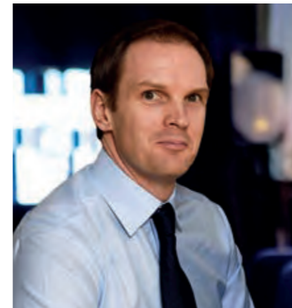
Dr Dan Poulter MP

Dr Poulter agrees: "Undoubtedly, awareness of mental health issues is now much greater, which makes the case for additional funding easier to argue," he says. "However, there