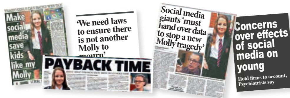
A small selection of just some of the important media coverage generated by the College in January