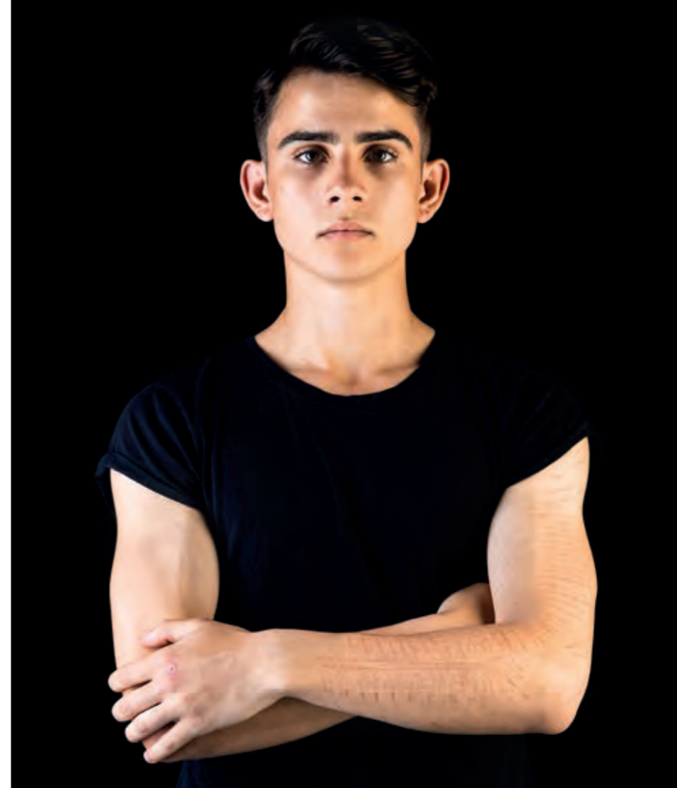
Wellcome Trust photography prize winner: Self-harm: The Teenage Epidemic (Alan) by Jude Wacks

Given their importance, then, it comes as something of a shock to realise that of the 30 national clinical audits commissioned by HQIP, only three are concerned with mental health. The much-vaunted parity between mental and physical health is still a fair way off, despite the critical role audits play in improving services.